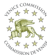
Council of Europe, 2016